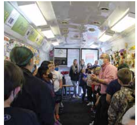
LEARNING LAB: Students listen to instruction before starting an experiment in the Mobile Ag Ed Science Lab visiting the Upper Adams Intermediate School in October.

without a price tag. Each class is $500 on average, which covers the cost of the educator and supplies for about 25 students.