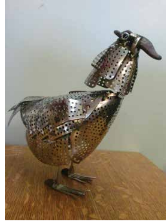
A NEW LIFE: Through upcycling, an old metal vegetable steamer is transformed into a chicken sculpture.