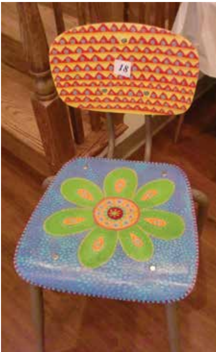
NO LONGER GARBAGE: This chair was going out with the garbage, but a fresh paint job gives it a bright new purpose.

PHOTOS COURTESY OF THE ADAMS RESCUE MISSION